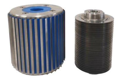
Example: complete set of knives 5 x 5 mm for dice and strips