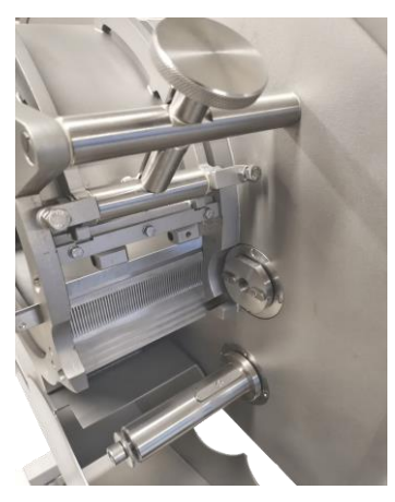
Slicing knife holder